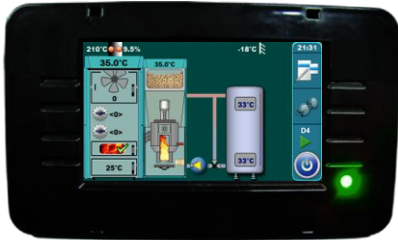
Multifunctional control with touch screen.